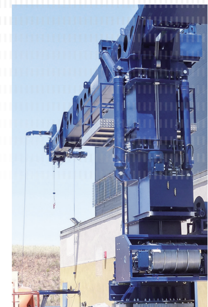
Safe at any story NORD drive technology gently moves the gondola and ensures precise positioning.

Accessing all sides. – Finally, two helical inline geared motors engage a gear ring in order to turn the whole machine, so that the gondola can be used on all sides and surface areas of the building. In this segment of the installation, another SK 500E frequency inverter also serves to support the soft start and stop movements of the gondola, and provides for variable rotation speeds.